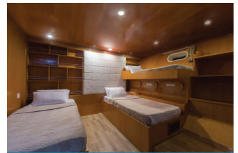
04 Standard & 1 Standard Seaview

Total 8 airconditioned cabins, 4 standard cabins providing double / twin / triple accommodation on the lower deck, 1 family suite providing double / twin accommodation for 4 pax, 1 seaview standard cabin for double / twin accommodation and 2 seaview suites providing double accommodation. All cabins are air-conditioned with gorgeous interiors and trendy fittings and en-suite bathrooms with hot and cold water.