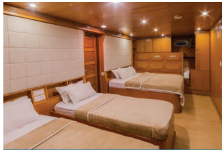
01 Family Quad Suite