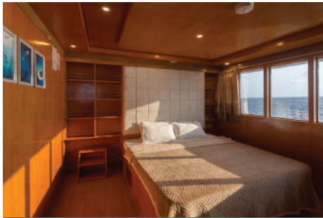
03 Seaview Suites